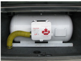
Trunk Mount Tank