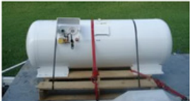
Bed Mount Tank