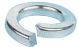
Gr. 5 Zinc Lock Washer