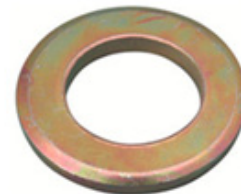
Gr. 5 Zinc Flat Washer