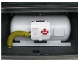
Trunk Mount Tank