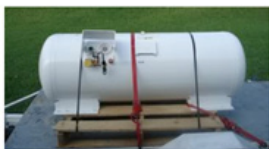
Bed Mount Tank