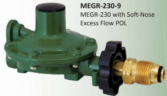
MEGR-230-9 MEGR-230 with Soft-Nose Excess Flow POL