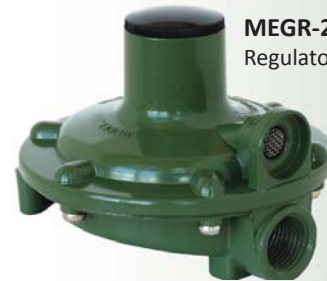
MEGR-230 Regulator with Drip Lip Vent